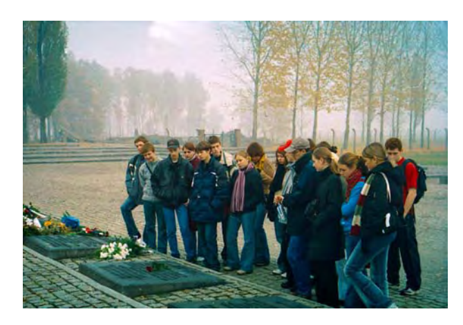
Laying flowers at the memorial in Birkenau, 27 October 2004. Russian high-school students from Moscow participated in the seminar "Auschwitz - History and Symbolism" organized by the education centre of the Auschwitz-Birkenau State Museum.