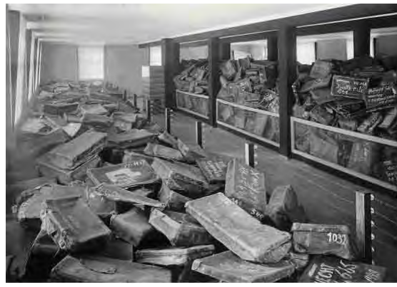
Auschwitz, Poland, postwar, Suitcases in the Museum, Yad Vashem

In Norway, the Directorate of Primary and Secondary Education encourages all schools to commemorate Holocaust Memorial Day and provides educational resources on its website. Many schools organize poetry readings and exhibitions, whereas others coordinate local torchlight processions and invite Holocaust survivors and witnesses to recount their personal stories.