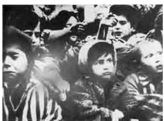
Children in the camp, raising their hands at the time of liberation, Auschwitz, Poland.