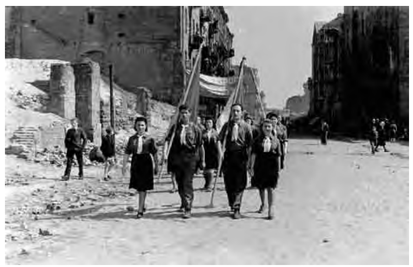
Warsaw, Poland, postwar, Memorial March for the Victims of the Holocaust.

Holocaust memorial days are a relatively new phenomenon in some countries, whereas they are long standing traditions in others. Governments have initiated and organized official ceremonies and special parliamentary sessions marking Holocaust Memorial Day that have been widely covered by the local, national and international media.