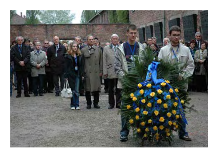
Laying a wreath at the Wall of Death in the courtyard of Block 11 at Auschwitz I-Stammlager. Youth delegations and the Ministers of Education of 48 State Parties to the European Cultural Convention, participants of the international seminar "Teaching Remembrance Through Cultural Heritage", Cracow and Auschwitz-Birkenau, Poland, 4-6 May 2005. (ICEAH, Auschwitz-Birkenau State Museum)

In October 2002, the Ministers of Education of the Council of Europe member states passed a resolution that a "Day of Remembrance" should be instituted in all schools in their respective countries to commemorate the Holocaust. In addition, during its sixtieth general assembly plenary meeting in November 2005, the United Nations decided to make 27 January an international day of commemoration to honour the victims of the Holocaust, and urged member states to develop educational programmes to impart the memory of this tragedy to future generations.<sup>2</sup>