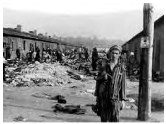
A former inmate near barracks in the camp, Bergen-Belsen, Germany.

Educators may wish to organize meetings with living witnesses (especially Holocaust survivors as well as liberators and rescuers), who can recount their experiences during the Second World War with students on this day. Live testimonies are very powerful and can contribute to a profound learning experience for students. In addition, previously recorded visual history testimonies can also be effective teaching tools. Teachers may wish to concentrate on what students learned from hearing the personal stories of witnesses and what they carry with them after listening to survivors' testimonies.