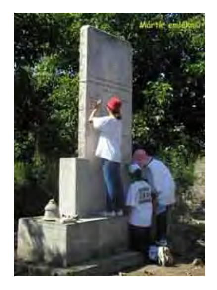
Students cleaning a deserted Jewish cemetery in Szob, Hungary, 2002. (Lauder Javne Jewish Community School in Budapest)