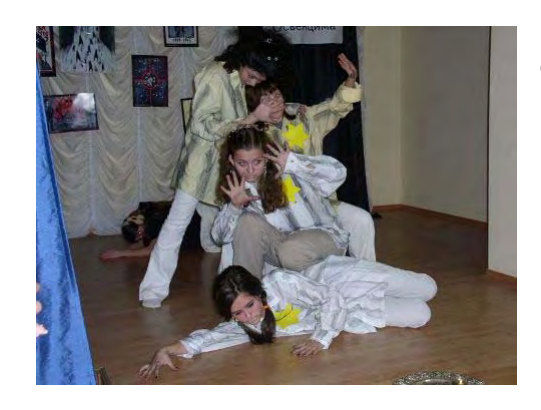
Performance by Zaporozhye JCC dance group as part of Marathon of Memory project, Ukraine 2005, Tkuma (Central Ukrainian Holocaust Foundation)

On 27January 2005, the Central Ukrainian Holocaust Foundation "Tkuma" organized a project known as "Marathon of Memory", aimed at increasing Holocaust consciousness in dozens of Ukrainian towns and cities. Events included an award ceremony for students who took part in a competition about the Holocaust; "Marches of the Living" to Holocaust-related authentic sites; roundtables with students and well-known public figures; and a press conference with representatives of international and local media in conjunction with the 60th anniversary commemoration ceremonies of the liberation of Auschwitz–Birkenau. In Odessa, the commemoration featured a combination of literary and artistic images and stories by Elie Wiesel, a Holocaust survivor and Nobel laureate. State and local officials throughout the country participated in these events.