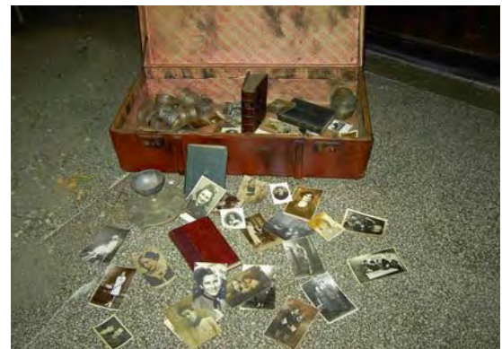
This suitcase, part of project for Holocaust Memorial Day, was created by students of the Remember Club, Vlaicu Voda National College, Romania, October 2004.