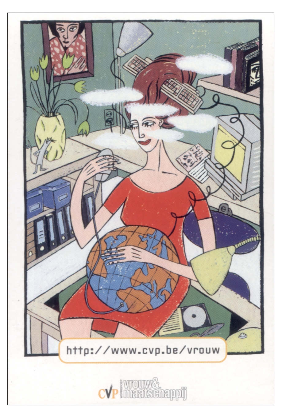
The work group Vrouw & Maatschappij is a political women's group of the Flemish CD&V political party in Belgium. Working for equal rights for both women and men, it focuses on equal representation in economic and political decision-making and supports professional and social regulations that enable family and work to be combined successfully.