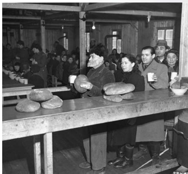
Jewish displaced persons receive bread rations at the Bindermichl displaced persons' camp in Linz.

After liberation, their pain and suffering were far from over. Living with the past proved to be extremely difficult and in