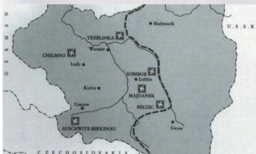
Map of the death camps in Nazi-occupied Poland

There were six death camps, all in Nazi-occupied Poland, established specifically to murder people (mainly Jews) by poison gas. Four of the death camps were established specifically for this purpose and were dismantled on completion of their function: Chelmno, Belzec, Sobibor and Treblinka. Revolts took place in Sobibor and Treblinka. Majdanek and Auschwitz-Birkenau were originally established as POW camps, slave labour and concentration camps, and ultimately also became extermination camps. They were both liberated by the Soviet Army towards the end of the war: Majdanek in July 1944 and Auschwitz-Birkenau in January 1945.