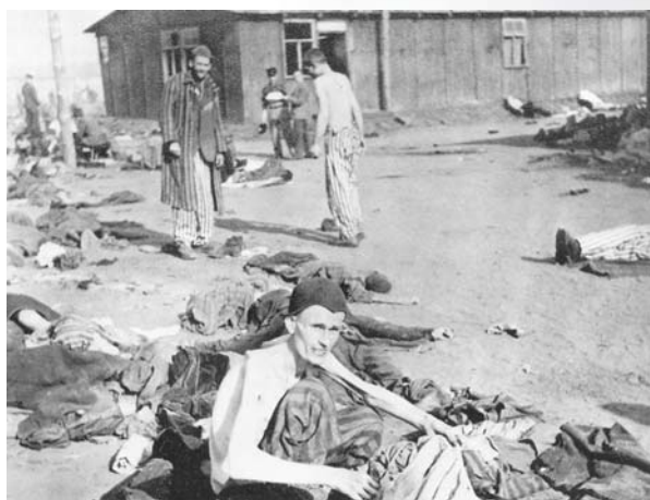
Bergen-Belsen inmates after liberation, 1945

Belsen DP camp had its own publishing house, which issued various books and magazines. The first and probably the most important document to appear in