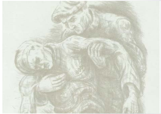
Solidarity by Richard Grune, lithograph 1947, Schwules Museum, Berlin.

Discrimination against homosexuals continued after the war, and gay concentration camp survivors were not acknowledged as victims of Nazi persecution. Some even