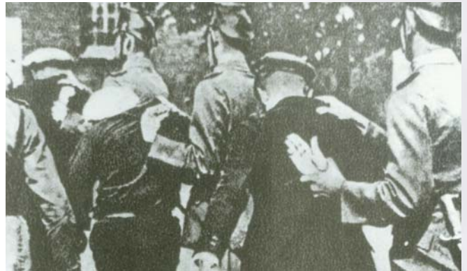
Political opponents being arrested. Berlin, Germany, 1933

Opponents of Hitler were murdered in the Night of the