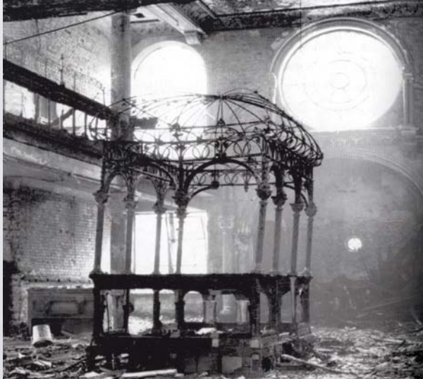
Torched Synagogue, Germany, November 1938

In November 1938, Herschel Grynszpan, a Jewish student in Paris, assassinated the Third Secretary at the German embassy, Ernst Vom Rath. Headlines appeared in the Nazi newspaper Der Angriff that stated, 'From this vile deed