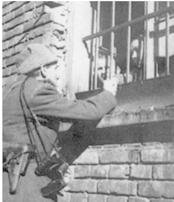
Russian soldier in Auschwitz

When the Red Army entered the gates of Auschwitz on 27 January 1945, they found only about 7,000 emaciated prisoners alive. These were too frail to leave when the