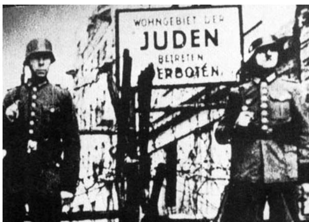
Entrance to the Lodz Ghetto: the sign reads 'Jewish residential district, entry forbidden'

The Nazis forced thousands of Jews to live in cramped areas that could not possibly accommodate the huge numbers being forced into them, often without either running water or a connection to the sewage system. As a result, starvation and disease were rampant, wreaking a huge death toll. It is estimated that between one million and one and a half million Jews died in the ghettos. The ghettos represented places of degradation, hardship and unimaginable suffering, where the Nazis subjected the inhabitants to brutality, shootings, beatings and hangings.