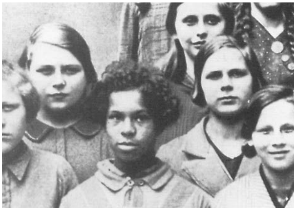
Image of mixed-race girl used in lectures on Race and Health in Dresden USHMM

Fifty years before the Holocaust, Germans were carrying out medical experiments on black people. Between 1894 and 1904 German settlers in the colony of German South Africa (part of present-day Namibia) systematically lynched members of the Herero tribe, raped their women and stole