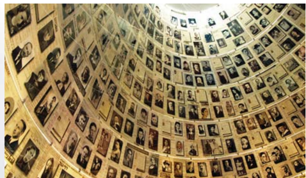
Yad Vashem Hall of Names

In an effort to boost its database, in 2004 Yad Vashem launched its Pages of Testimony project. Visitors to the museum and to its website were encouraged to fill in special forms on the victims, which were then double-checked against existing archival information. The project was a huge success, and 55 per cent of the four million names came from Pages of Testimony.