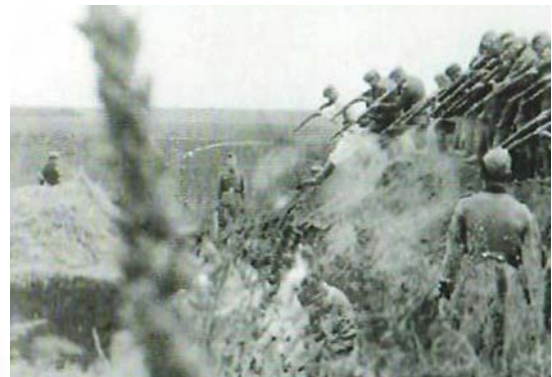
Einsatzgruppen in action, Dubossari, 1941

Einsatzgruppen were mobile killing squads who murdered Jews throughout Russia and eastern Europe in towns, villages, fields and cemeteries. On 21/22 June 1941 Nazi Germany invaded the Soviet Union (Operation Barbarossa), where special killing squads called Einsatzgruppen followed the German army and murdered more than 1.5 million people. They shot mostly Jews but also Gypsies, Communists and others, on racial and ideological grounds. Einsatzgruppen comprised German police and SS units, local collaborators, and officers and soldiers of the German army. They continued to operate in rural areas in parallel to the exterminations taking place in the death camps.