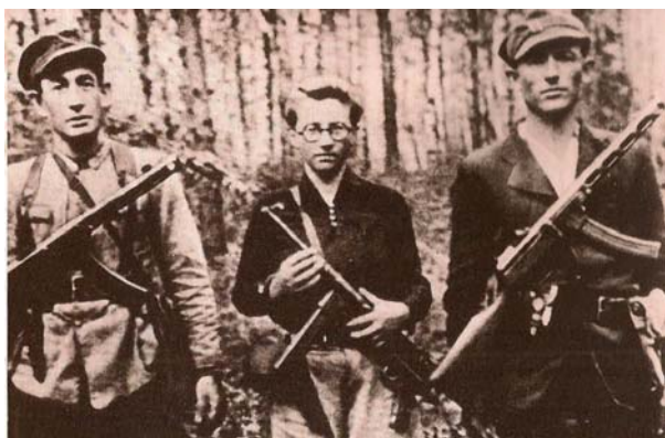
Partisans in forest near Lublin.

During World War II an estimated 20,000 to 30,000 Jews fought bravely as partisans in resistance groups that operated under cover of the dense forests of eastern Europe. From the Nazis' rise to power in 1933 to the end of the Third Reich in 1945, Jews as well as other victims of Nazism participated in many acts of resistance. Organised armed resistance was the most direct form of opposition to the Nazis in many areas of German-occupied Europe.