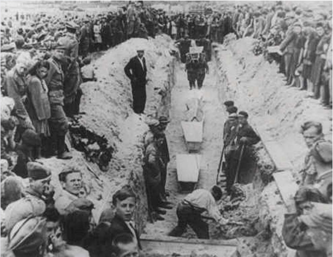
Mourners crowd around a narrow trench as coffins of pogrom victims are placed in a common grave, following mass burial service. Kielce, Poland, after July 4, 1946

The Kielce Pogrom sparked intense fear in the already traumatised post-war Polish Jewish community. While the pogrom was not an isolated instance of anti-Jewish violence in post-war Poland, the Kielce massacre convinced many Polish Jews that they had no future in Poland after the Holocaust and persuaded them to flee the country.