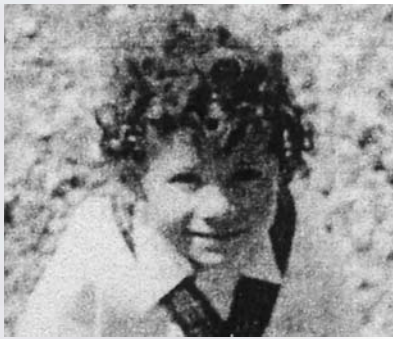
Suzi aged about two years