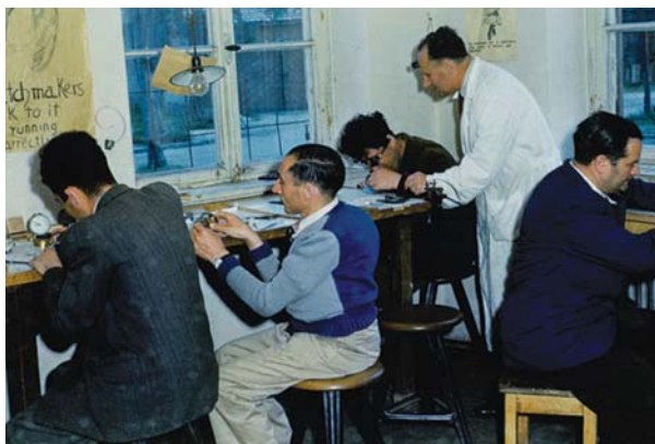
Jewish displaced persons study watchmaking in the Föhrenwald Organization for Rehabilitation through Training (ORT) school, 1953.