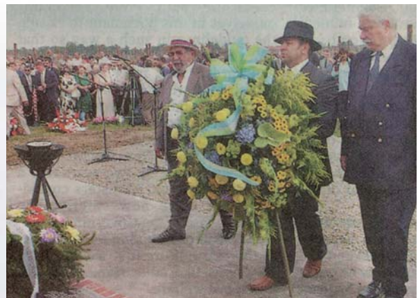
Roma leaders at wreath-laying in Auschwitz Czarek Sokolowski/AP, The Irish Times 3 August 2004

250 Romany children were murdered in Buchenwald in January 1940: they were used to test the efficacy of the Zyklon B crystals, later used in the gas chambers in the death camps. In December 1941 Himmler ordered all Romanies remaining in Europe to be deported to Auschwitz-Birkenau for extermination. They were brought there from German-occupied territories that included Moravia and