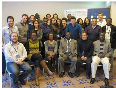
Participants and staff of the 2013 Raphael Lemkin Seminar for Genocide Prevention, Global Edition.

By introducing special focus areas in 2014, including Holocaust denial, new technologies and new research fields, the IHRA has identified contemporary areas of concern, thus offering institutions the opportunity to explore new fields and further shape the future of Holocaust remembrance, research and education.