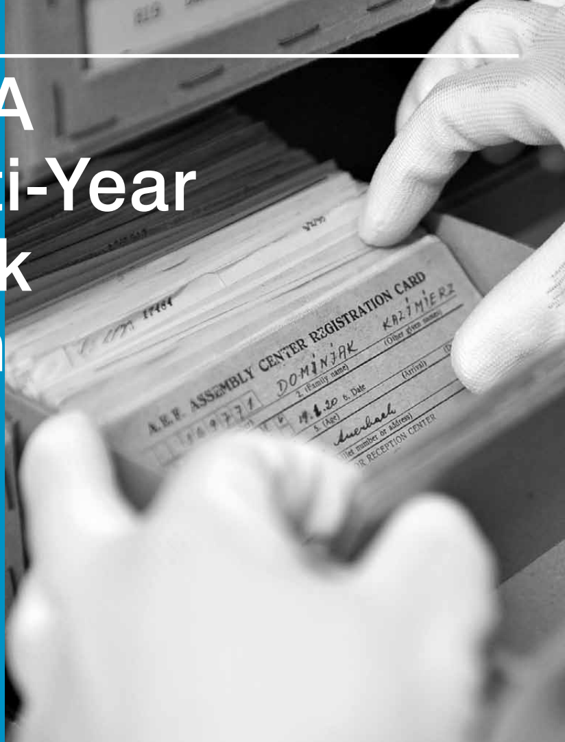
ITS Bad Arolsen Central Index of Names. The Central Name Index contains 50 million items relating to the fates of 17.5 million victims of Nazi persecution.

The IHRA has implemented a Multi-Year Work Plan (MYWP), giving special attention to killing sites, access to archives, Education research and Holocaust Memorial Days.