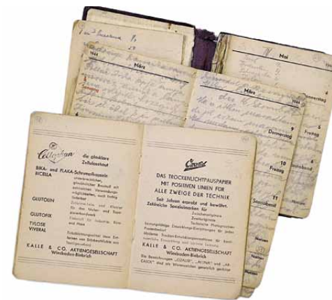
Holocaust-era documentation, Yad Vashem Archives.

The AWG focuses on the promotion of Holocaust research and international cooperation on scholarship. Constant efforts to encourage member countries to commit to opening Holocaust-related archives led to the Multi-Year Work Plan (MYWP) on Archival Access — while the opening up of the International Tracing Service (ITS) archive has been a particular focus of its work throughout the years. The AWG identifies and discusses key academic developments in the field of the Holocaust and related topics, and members of the AWG have also taken leading roles in the MYWP on Killing Sites.