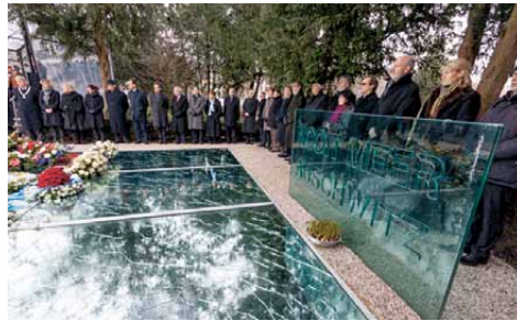
National Holocaust Commemoration 2015 organized by the Dutch Auschwitz Committee.

The MMWG has mobilized support and expertise to provide guidance to new museums and memorials, as well as to those in transition and in need of preservation. One initiative launched by the MMWG was the renewal of the 'Ex-Yugoslav' Pavilion at the Auschwitz-Birkenau State Museum — a project of distinct international importance. The MMWG has also developed two websites exploring, separately, the culture of remembrance and the development of memorial sites: 'Cultures of Remembrance — a Network' and 'Memorial Museums', hosted by the Topography of Terror Foundation. The International Memorial Museums Charter was drafted by the MMWG in 2012 to develop guidelines on ethics and the principal concerns of memorial museums for victims of the Holocaust.