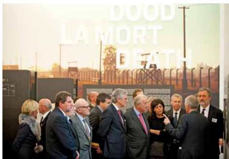
Opening of the Kazerne Dossin — Memorial, Museum and Documentation Centre on Holocaust and Human Rights.

During Belgium's Chairmanship, two high-visibility plenaries in Mechelen and Liège took place, attracting widespread media attention. The most lasting contribution of IHRA membership was the inauguration of the 'Kazerne Dossin — Memorial, Museum and Documentation Centre on Holocaust and Human Rights' in November 2012, on the spot where the Nazis and their collaborators organized the deportation of more than 25,000 men, women and children. In the first full year of its existence, the museum attracted more than 100,000 visitors and is rapidly gaining a reputation for excellence in the international arena.