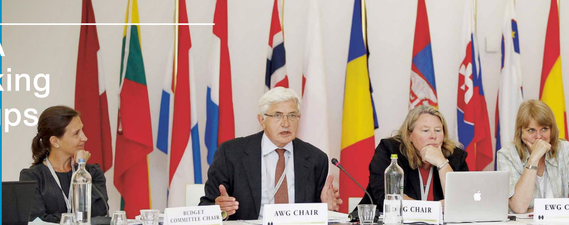
Working Group Chairs at the IHRA Plenary session in Mechelen, Belgium in 2012.

The IHRA is composed of four Working Groups: the Academic Working Group, the Education Working Group, the Communication Working Group, and the Memorials and Museums Working Group.