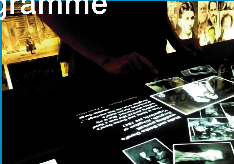
A Centropa interactive table in the Los Angeles Museum of the Holocaust. Centropa is an IHRA grant recipient and is one of the few oral history projects that chose to forego the use of video when interviewing Holocaust survivors and instead digitized 22,000 old photographs belonging to 1,200 elderly Jews still living in Europe.

Since its inception, the IHRA has funded 390 projects across 44 countries worldwide. However, the IHRA's Grant Programme provides far more than financial backing alone: by contributing the international expertise of its Working Groups and the Funding Review Committee, the IHRA offers valuable advice and thorough evaluation, ensuring that funded projects perform to the highest possible level.