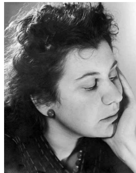
The Dutch Jew Etty Hillesum kept a diary during the occupation of the Netherlands. The diary and the many letters she wrote, also from Camp Westerbork, were of high literary quality. After the war they were published in more than ten languages. Hillesum was most likely murdered in Auschwitz on 30 November 1943.

IHRA membership has, without a doubt, influenced policy-making in the Netherlands. It led to the founding of the Centre for Holocaust and Genocide Studies in 2002 — an institute that offers an annual Masters program on the Holocaust. In 2010, the Centre merged with the Institute for War, Holocaust and Genocide Studies (NIOD). International cooperation between museums and research institutions from the Netherlands and other IHRA member states has intensified, new projects have been initiated and new discussion topics have come to light. Specific examples of projects include the Dutch-Polish educators' exchange, the multi-lingual digital exhibition on the genocide of the Roma and Sinti, and the book 'The Holocaust and Other Genocides', which was published during the Dutch Chairmanship.