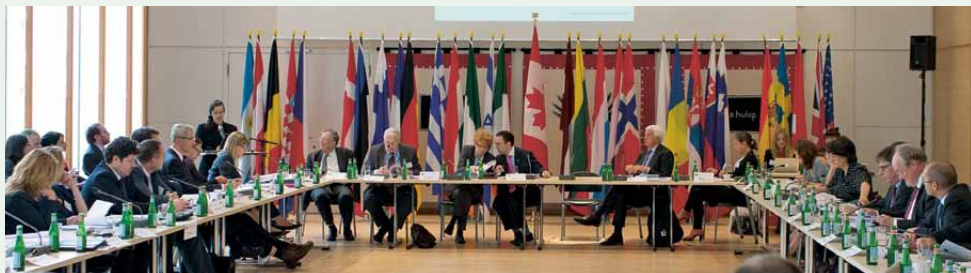
IHRA Plenary 2013 in Berlin.

On 27 January 2015, 70 years after the liberation of the German Nazi concentration and extermination camp Auschwitz-Birkenau and 15 years after the original Stockholm Declaration, the IHRA countries reaffirmed the commitments undertaken in Stockholm — this publication aims to provide a snapshot of the vital work which the IHRA has carried out over the last 15 years. It has been my honor to chair the IHRA through this important anniversary. It has been a time for reflecting on what we have achieved thus far and for determining that this is not a time to ease up on our efforts. Sadly, incidents of antisemitism, xenophobia, genocide and Holocaust denial and distortion are not confined to the past but continue to be real threats to the health of our societies. These threats highlight the very real need for an intergovernmental body like the IHRA which keeps memory and understanding of the Holocaust firmly on the political agenda.