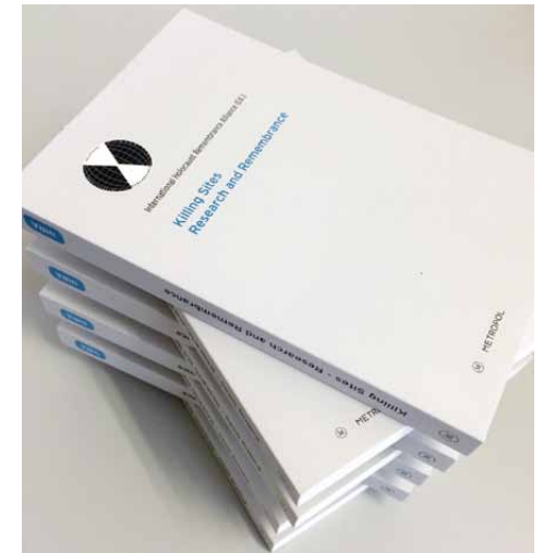
IHRA's first publication 'Killing Sites — Research and Remembrance'.

A conference will be held in Switzerland in 2016 to share and discuss the findings among academics, educational experts, decision-makers, NGOs, diplomats and funding organizations.