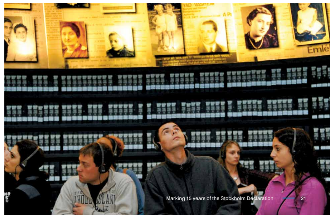
The Hall of Names in the Holocaust History Museum, Yad Vashem, Jerusalem.

Participants at Salzburg Global Seminar's Holocaust Education and Genocide Prevention session discuss IHRA teaching guidelines.