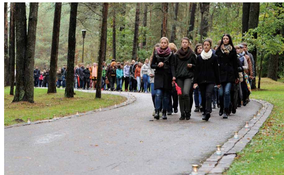
Memory Road initiative, Lithuania.

In Luxembourg, interest in the Holocaust is growing constantly. The intense networking among IHRA member countries has contributed strongly to Luxembourg re-evaluating its focus on the Holocaust. The report on Jewish assets has drawn public attention to the subject and has raised new questions about the involvement of Luxembourgers in the Holocaust and the role of Luxembourg civil servants in deportations. In 2004, the European Ministers of Education established a special Holocaust Memorial Day, in which schools play an eminent role. Furthermore, the government recently made the decision to erect a dedicated monument to commemorate the victims of the Holocaust.