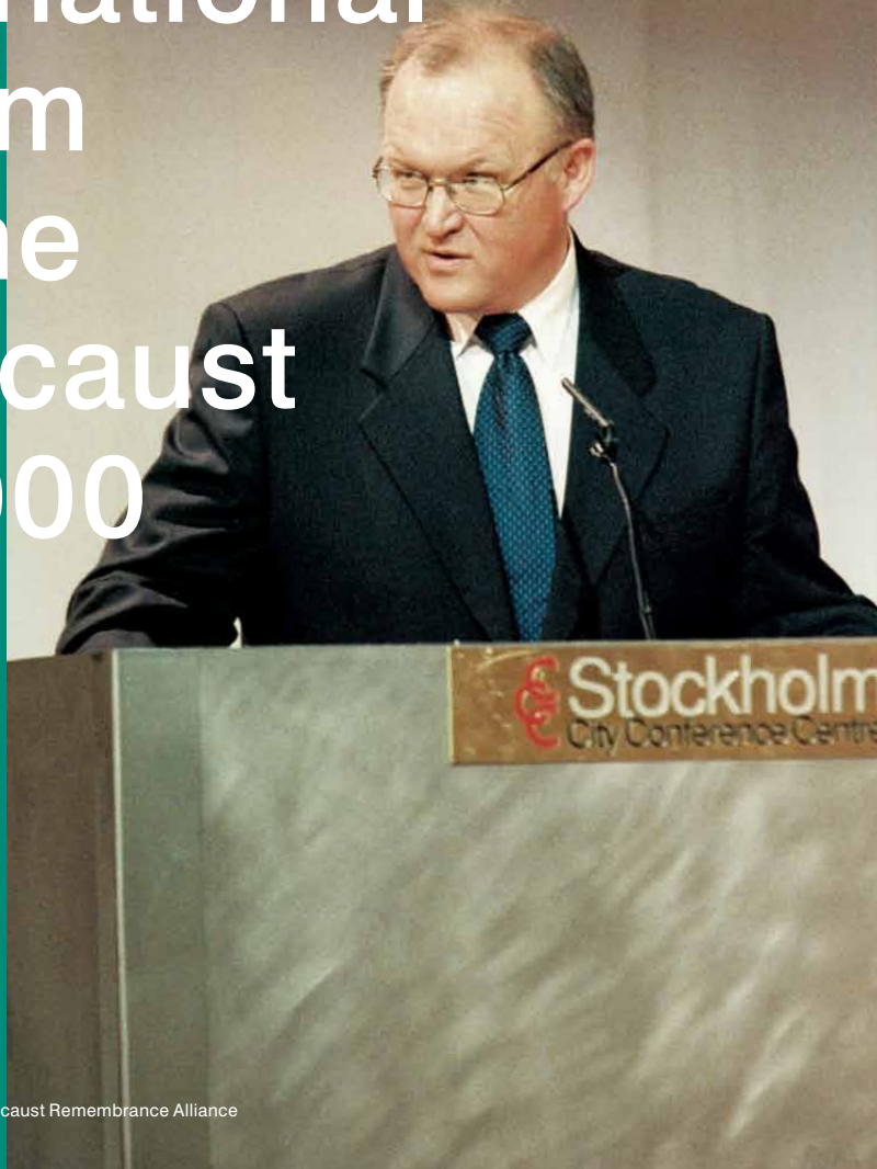
Former Swedish Prime Minister Göran Persson addresses the audience at the first Stockholm International Forum on the Holocaust in 2000.

1. — The Holocaust (Shoah) fundamentally challenged the foundations of civilization. The unprecedented character of the Holocaust will always hold universal meaning. After half a century, it remains an event close enough in time that survivors can still bear witness to the horrors that engulfed the Jewish people. The terrible suffering of the many millions of other victims of the Nazis has left an indelible scar across Europe as well.