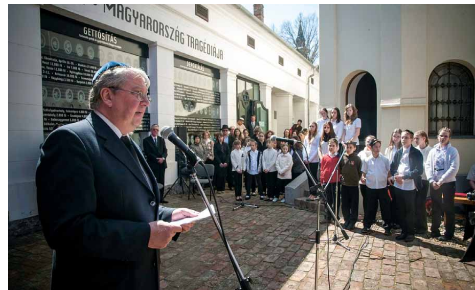
Commemoration ceremony in Budapest during the Canadian Chairmanship.

On joining the IHRA, Ireland established the 'Standing Committee on Holocaust Education, Research and Remembrance', which consists of governmental representatives, the 'Holocaust Education Trust Ireland' (HETI), the Irish Jewish Museum, and academics. The government has worked closely with HETI and other organizations to promote Holocaust education and awareness through teacher education programs, schools' initiatives such as the 'Crocus Project', and the 'National Holocaust Memorial Day' commemoration. The 'Certificate in Holocaust Education', awarded by the Herzog Centre at Trinity College Dublin, provides teachers with continuous professional development.