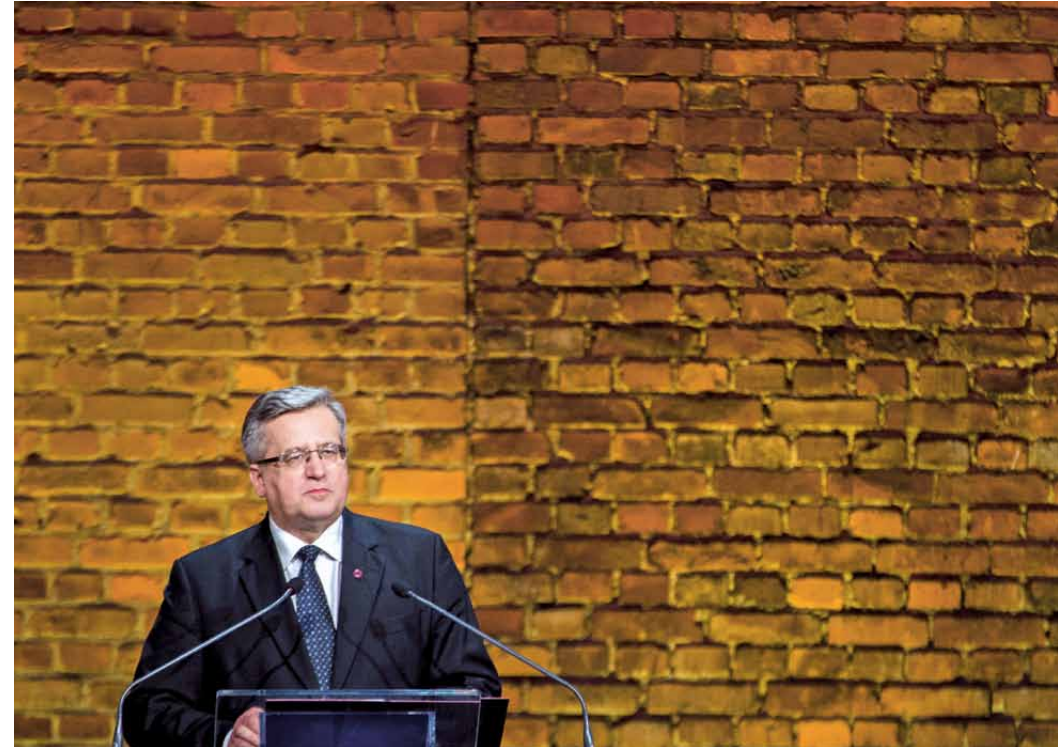
The President of the Republic of Poland Bronisław Komorowski at the commemoration ceremony of the 70th anniversary of the liberation of KL Auschwitz-Birkenau held on 27 January 2015

We are determined to continue to develop our international cooperation on Holocaust education, remembrance and research, and the prevention of future genocides.