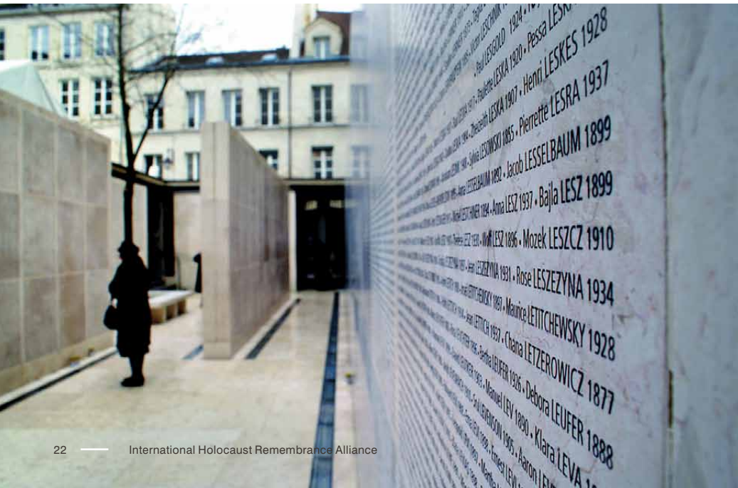
Woman looking at the Wall of Names at the Mémorial de la Shoah in Paris.

— Speech by Elie Wiesel at the Ceremonial Opening of the Stockholm International Forum, 26 January 2000.