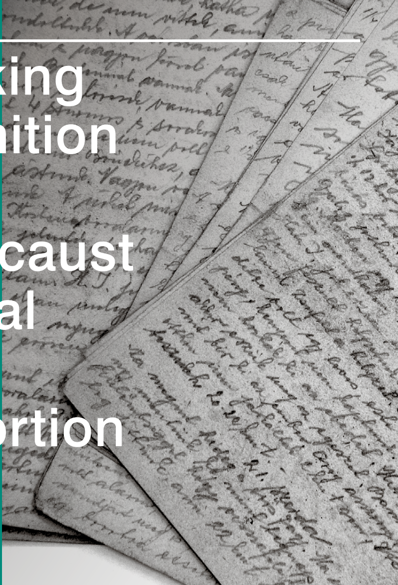
Holocaust-era documentation, Yad Vashem Archives.

The present definition is an expression of the awareness that Holocaust denial and distortion have to be challenged and denounced nationally and internationally, and need examination at a global level. The IHRA hereby adopts the following legally non-binding working definition as its working tool.