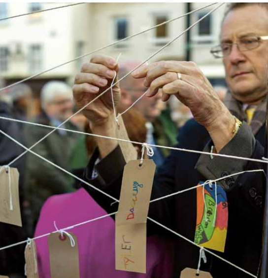
South Lakeland Holocaust Memorial Day 2014

Switzerland was the first country to establish a national IHRA support group, by bringing together representatives from teachers' associations, Jewish NGOs, Sinti and Roma organizations, governmental departments and universities. The underlying idea was to promote the implementation of the Stockholm Declaration and the goals of the IHRA in civil society. This combined top-down/bottom-up approach turned out to be particularly successful in a multilingual and federalist country. Teamwork and diversity are Switzerland's strengths.