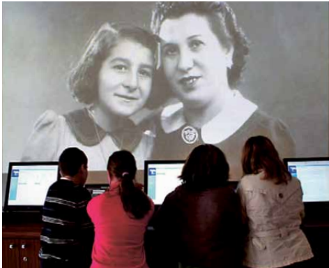
Children consulting the Mémorial de la Shoah website where the names of Jews deported from France are registered.

France's accession to the IHRA offered an opportunity to create a network of national Holocaust experts, ensuring more efficient sharing of information between institutions and wider dissemination of activities in the areas of Holocaust teaching, research and remembrance. These discussions have also laid the foundation for enhanced educational work and a closer partnership between the authorities and the various remembrance sites in France. This, in turn, has formalized ties through an international network which has been enriched over the years, thus preventing educational and memorial activities from becoming nothing more than rituals.