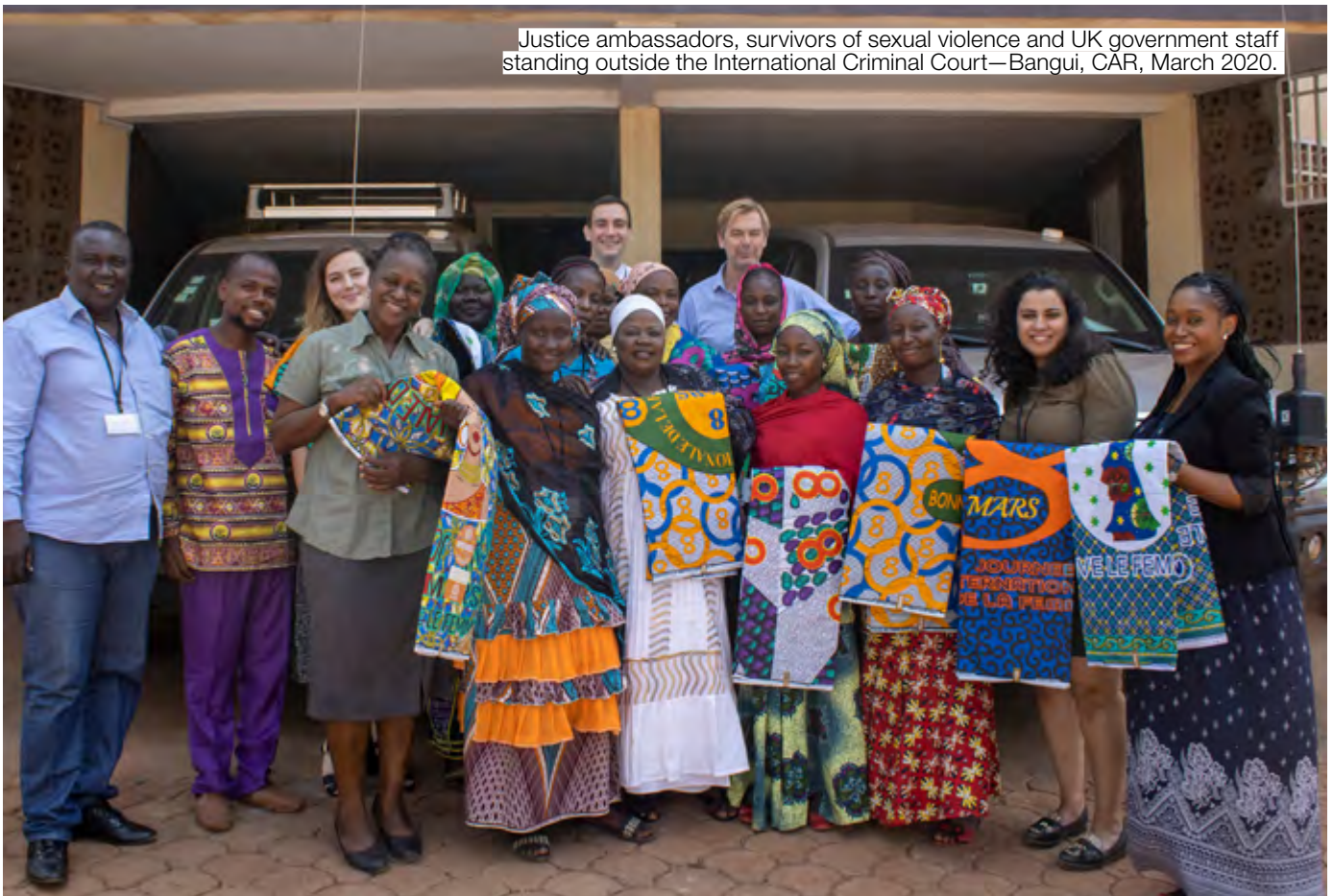
Justice ambassadors, survivors of sexual violence and UK government staff standing outside the International Criminal Court—Bangui, CAR, March 2020.