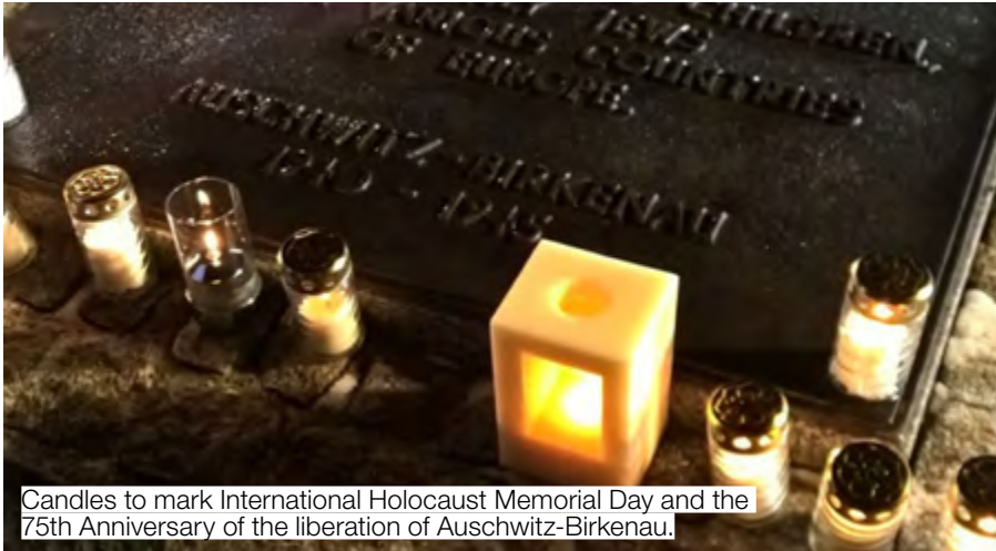
Candles to mark International Holocaust Memorial Day and the 75th Anniversary of the liberation of Auschwitz-Birkenau.

adopted the draft non-binding working definition [28] of anti-gypsyism/anti-Roma discrimination by consensus in an extraordinary Heads of Delegation meeting.