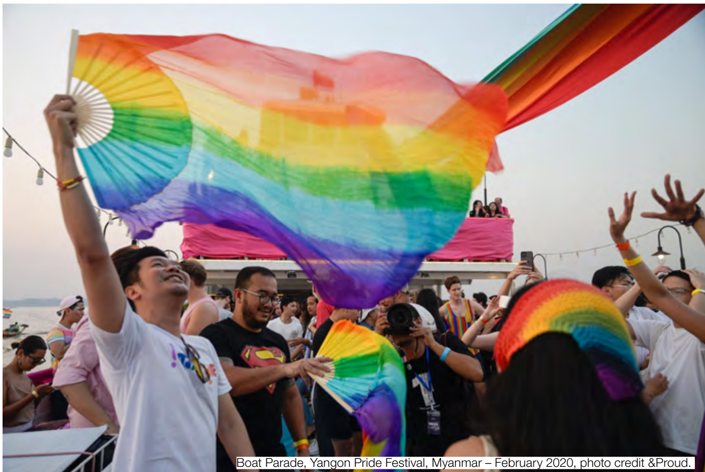
Boat Parade, Yangon Pride Festival, Myanmar – February 2020

The UK worked to promote the safe schools declaration in Myanmar.