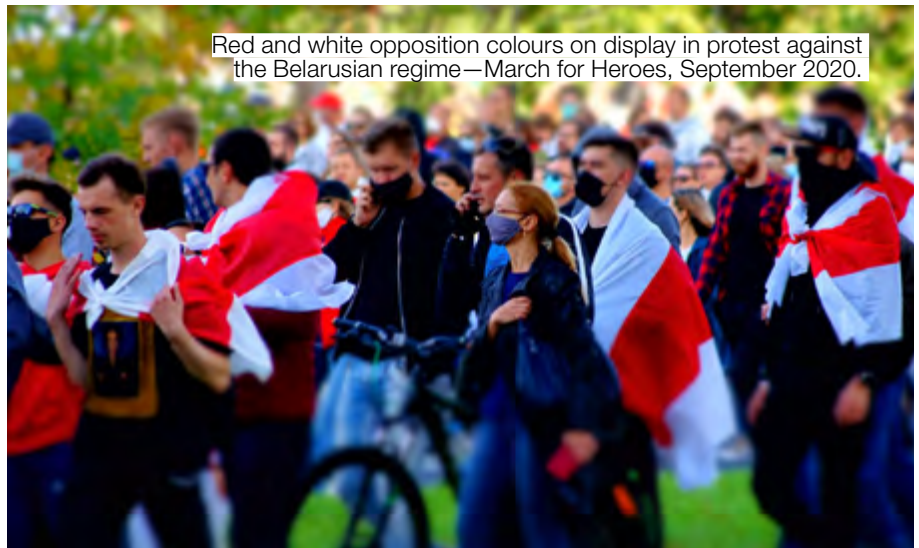
Red and white opposition colours on display in protest against the Belarusian regime—March for Heroes, September 2020.

Belarusian authorities prevented all non-sanctioned public gatherings and events. To enforce this, the authorities deployed violence, backed by the use of stun grenades, rubber bullets, tear gas and water cannon, to disperse large, peaceful gatherings. The Deputy Minister of Interior Gennady Kazakevich threatened the use of lethal weapons to disrupt protests and demonstrations further. The authorities introduced laws