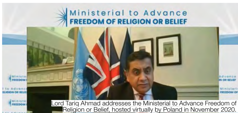
Lord Tariq Ahmad addresses the Ministerial to Advance Freedom of Religion or Belief, hosted virtually by Poland in November 2020.

The UK continues to play a key role at IHRA. In October, IHRA