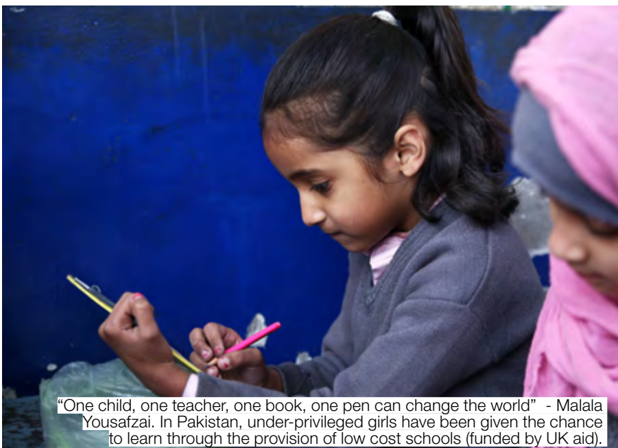
“One child, one teacher, one book, one pen can change the world” - Malala Yousafzai. In Pakistan, under-privileged girls have been given the chance to learn through the provision of low cost schools (funded by UK aid).

and middle-income countries by 2025, aiming to get, first, 40 million more girls in primary and secondary school and, secondly, one third more girls reading by the age of ten.