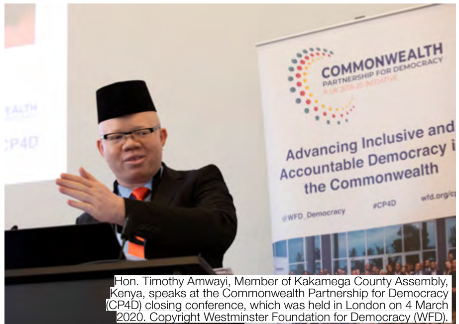
Hon. Timothy Amwayi, Member of Kakamega County Assembly, Kenya, speaks at the Commonwealth Partnership for Democracy (CP4D) closing conference, which was held in London on 4 March 2020.

WFD helped young people get involved in politics in Nigeria [2] , Uganda [3] , North Macedonia [4] and Bosnia and Herzegovina [5] . They worked with the parliament in Sierra Leone [6] to submit its first report on implementing the UN Convention on the Rights of Persons with Disabilities, and the parliament of North Macedonia to adopt the Declaration for Active Political Participation of Persons with