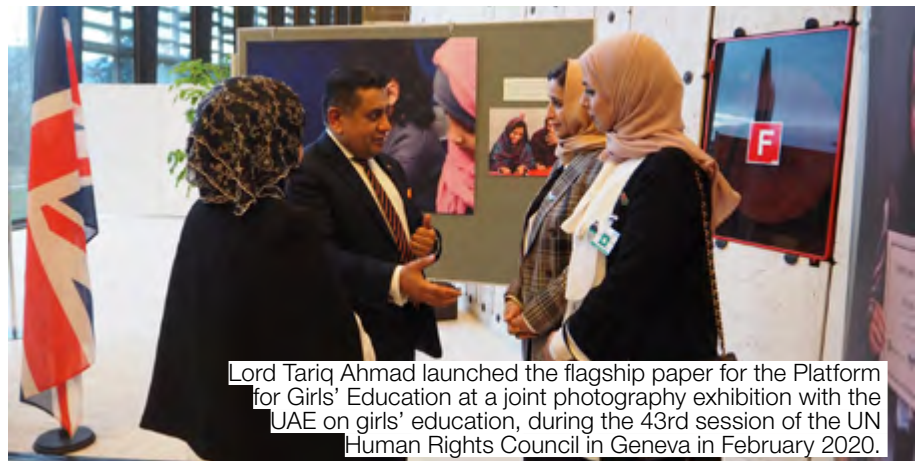
Lord Tariq Ahmad launched the flagship paper for the Platform for Girls' Education at a joint photography exhibition with the UAE on girls' education, during the 43rd session of the UN Human Rights Council in Geneva in February 2020.