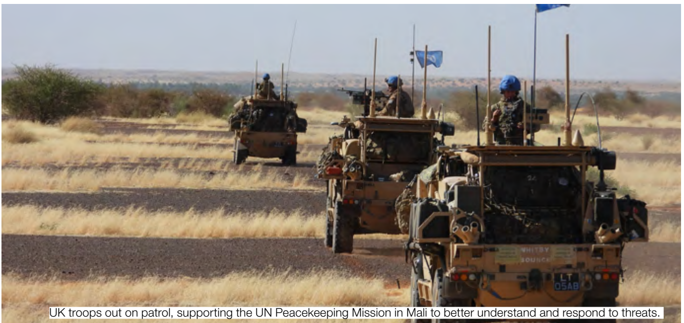
UK troops out on patrol, supporting the UN Peacekeeping Mission in Mali to better understand and respond to threats.

In August, a coup d'état led to the detention of several political and military figures, including the former