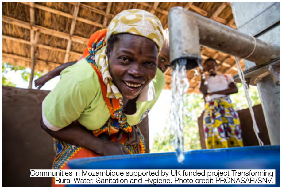
Communities in Mozambique supported by UK funded project Transforming Rural Water, Sanitation and Hygiene.

The UK is committed to global health, including ending the preventable deaths of mothers, newborn babies and children by 2030. Within the UN Omnibus Resolution on the COVID-19 pandemic, we secured commitments to responsive, accountable and people-centred health systems, and protected references to the right of women and girls to the enjoyment of the highest attainable standard of health, including sexual and reproductive health and rights.