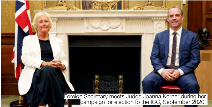
Foreign Secretary meets Judge Joanna Korner during her campaign for election to the ICC, September 2020.

rights, media freedom, LGBT+ rights and freedom of assembly. These also included country-specific statements and support for individual human rights defenders in Egypt, Saudi Arabia and Iran .