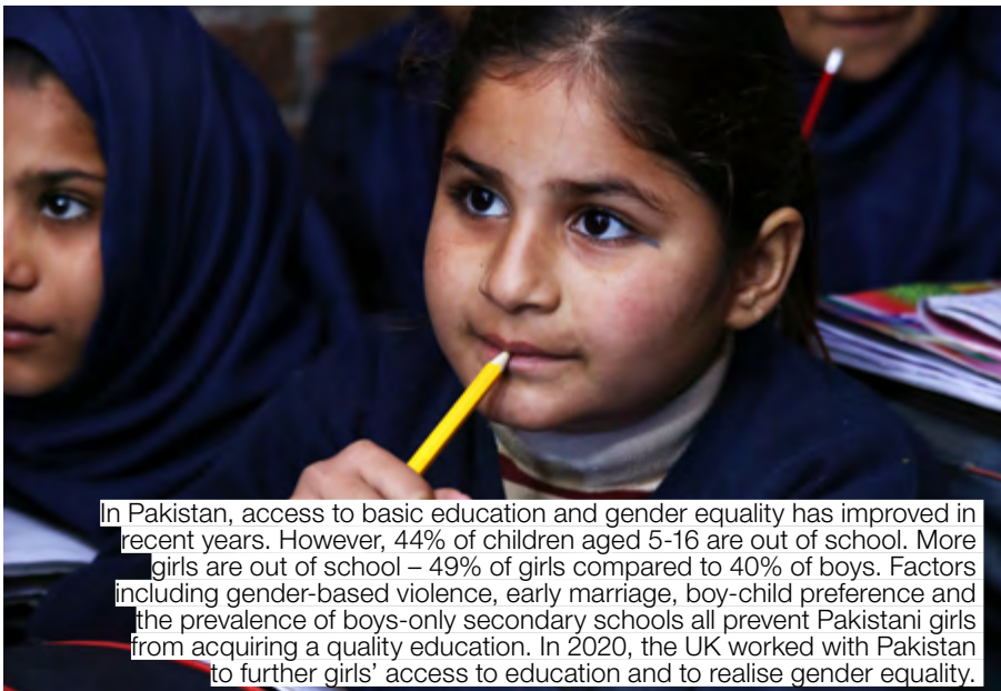
In Pakistan, access to basic education and gender equality has improved in recent years. However, 44% of children aged 5-16 are out of school. More girls are out of school – 49% of girls compared to 40% of boys. Factors including gender-based violence, early marriage, boy-child preference and the prevalence of boys-only secondary schools all prevent Pakistani girls from acquiring a quality education. In 2020, the UK worked with Pakistan to further girls' access to education and to realise gender equality.