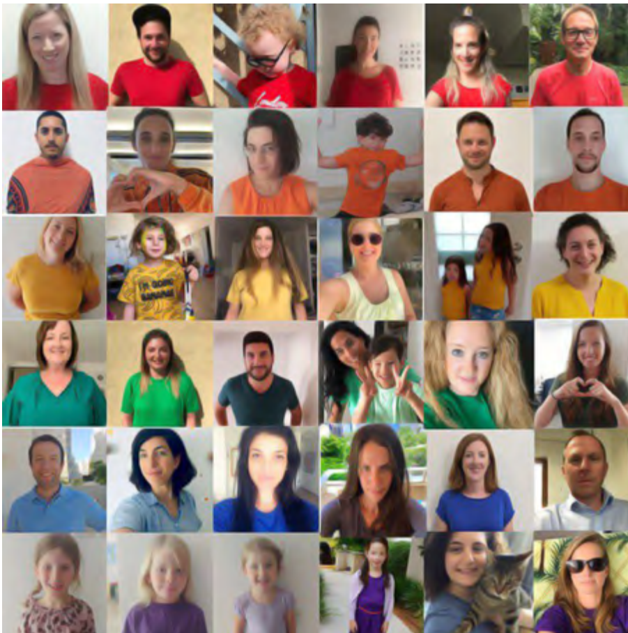
To mark Pride in June 2020 during the COVID-19 pandemic, British Embassy staff in Israel made a collage with photos of embassy staff and families to voice their unequivocal support for the LGBT+ community.

The UK's diplomatic network continued to champion the rights of LGBT+ people. More posts than ever flew the rainbow and transgender flags, including for the first time the British Embassies in Moscow and Beijing. In Turkey , the ban on peaceful Pride marches and the veto on LGBT+ cultural activities, seminars and discussions continued to be rigorously enforced. We continued to appeal to the Turkish authorities to relax the bans. In Panama , our Embassy raised concerns about the impact of gender-based COVID-19 restrictions on the country's transgender community, which limited their physical access to healthcare and public services. We facilitated conversations with civil society and like-minded embassies to raise LGBT+ people rights with the Panamanian Government; we ran a public campaign on human rights with a focus on the rights of LGBT+ people, and raised the rainbow flag during PRIDE month. Our missions in the Caribbean region consistently raised the importance