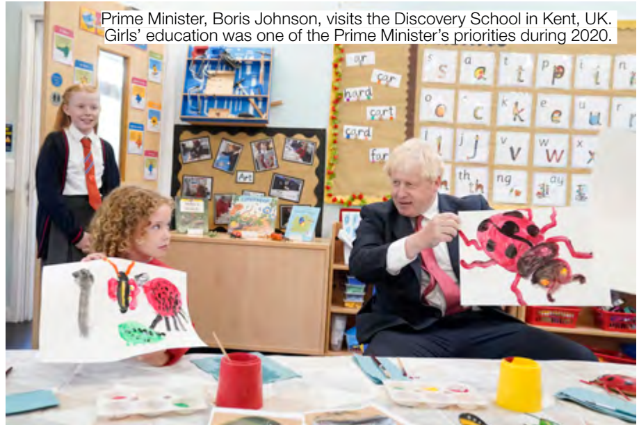
Prime Minister, Boris Johnson, visits the Discovery School in Kent, UK. Girls' education was one of the Prime Minister's priorities during 2020.

We welcomed the ICAI report into SEA by international peacekeepers. We continued to drive change on SEA and SH through our programmes, including the Safeguarding Innovation and Engagement fund, Project Soteria, Resource and Support Hub, and the CSSF. Supporting victims and survivors of SEA and SH remains at the heart of our approach. As part of this, a new programme will begin in early 2021 to support victims and survivors, and to help the sector understand and implement a victim/survivor-centred approach.