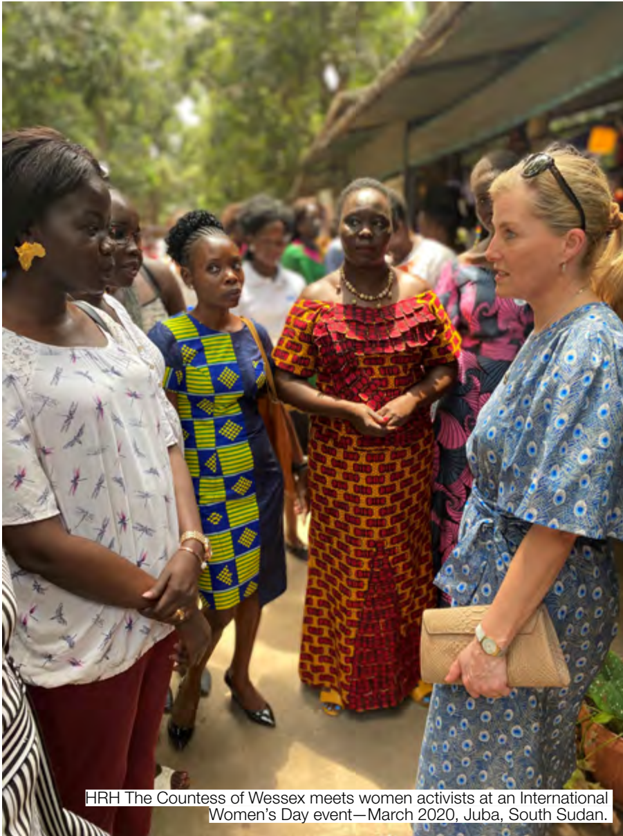
HRH The Countess of Wessex meets women activists at an International Women's Day event—March 2020, Juba, South Sudan.

used sexual violence as a form of torture and humiliation, particularly targeted at political prisoners [147] .